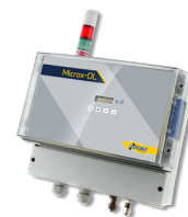
MICROX-OL Online Oxygen Analyser