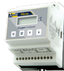
MICROX Oxygen Analyser