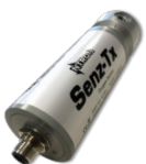
SENZTX Oxygen Transmitter