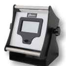
GAZTRAK Portable oxygen & moisture measurement